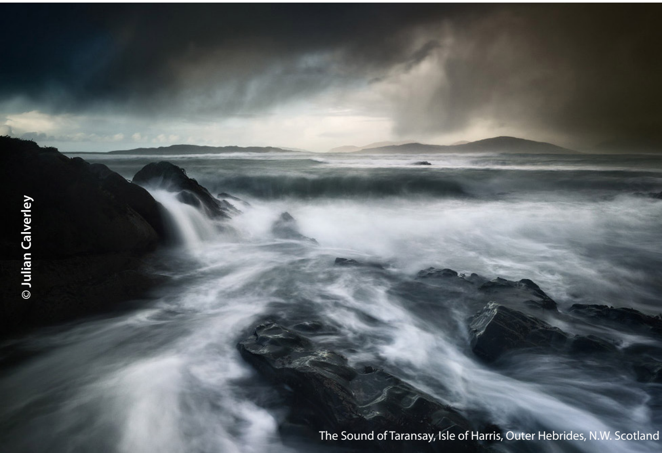
The Sound of Taransay, Isle of Harris, Outer Hebrides, N.W. Scotland