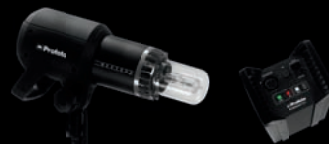
ProDaylight Air 400 W and 800 W