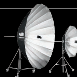
The line of Profoto Giant Reflectors consists of the the parabolic Giant Reflectors Giant Reflector 180 (180cm) 10 03 18 Giant Reflector 240 (240cm) 10 03 19 Giant Reflector 300 (300cm) 10 03 20 plus the Giant Silver 150 cm – 10 03 16, and Giant Silver 210 cm – 10 03 17. Optional front diffusers are available for all Giants.