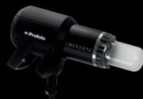
ProTungsten Air 500 W and 1000 W